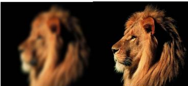
Fig. 3: Real super-resolution of the moon from 60 images acquired with a Nikon D70s SLR camera and a lens (18-70mm, F3.5-4.5) set at a focal length of 38mm (35mm equiv.: 57mm). (a) The moon as acquired by the camera (60x60 px); (b) Super-resolved image of the moon (600x600 px) with MRNSD restoration method.

From the above figures, we can see that all three methods give considerable improvements in image resolution. They also require high computational power. For the algorithms from Sections 3.1 and 3.2, only computer simulations were shown where the original image is perfectly reconstructed. While the memory requirements are higher for the algorithm in Section 3.1, the algorithm from Section 3.2 requires a slightly larger number of input images ( K > S = \lceil L/N \rceil instead of K > (L - 1)/(N - 1) ). The algorithm from Section 3.3 is tested in an experiment using real images from a digital camera as input. The result can therefore only be evaluated visually. It does not put specific requirements on the minimum number of input images and performs pair wise registration of the images.