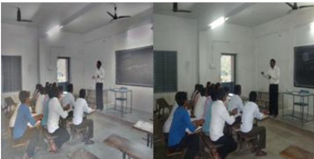
Figure. 2: Results using algorithm from Section 3.2. The high resolution image (b) is perfectly reconstructed from 5 shifted low resolution images (a).

For the algorithm from Section 3.3, we consider a set of real images as they are acquired by a digital camera. The registration approach considered here is based on continuous moments. Since it takes a sampling point of view, image samples should be modified as little as possible by internal post-processing occurring in a digital camera after acquisition. The set of images is thus acquired by a SLR digital camera (a Nikon D70s) in RAW format. The experiment is presented in Figure 3. Sixty pictures of the moon are taken with a digital SLR camera and a lens with a focal length at 38mm (35mm equivalent: 57mm) and settings: F16, 1/60s, ISO 200. The PSF in this case is not estimated and is directly approximated with a cubic B-spline at scale I. The MRNSD algorithm (modified residual norm steepest descent) is used as restoration method [13]. Figure 3a shows the moon as acquired by the camera and Figure 3b presents the obtained super-resolved image where details of the moon can be observed.