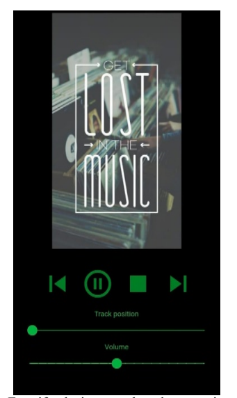
Figure 2. Emotify playing song based on emotion detected.

Microsoft emotion recognition API that we have used provides an accuracy of 60% which has been evaluated for over 1 million faces.