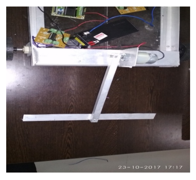
Fig 5: Leveling arm of robot

The leveling arm of robot is driven by DCmotor which is run by a motor driver L293D. similar to the tilling arm, the leveling arm rotates in opposite direction after given time. Thus allows the mud stuck to fall.