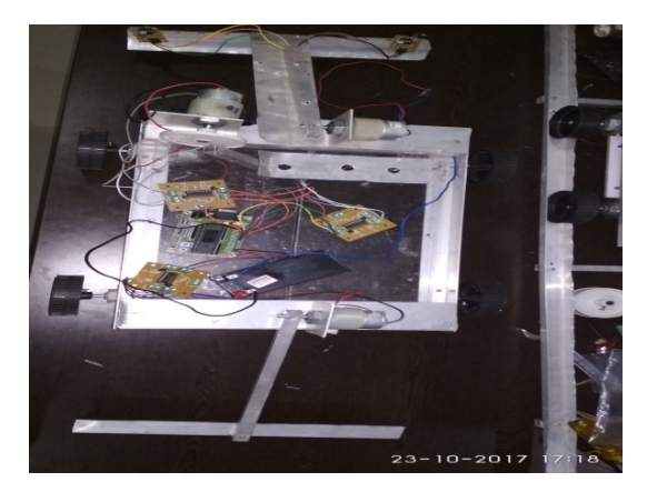
Fig 6: Finalisined Sowing and Tilling Robot