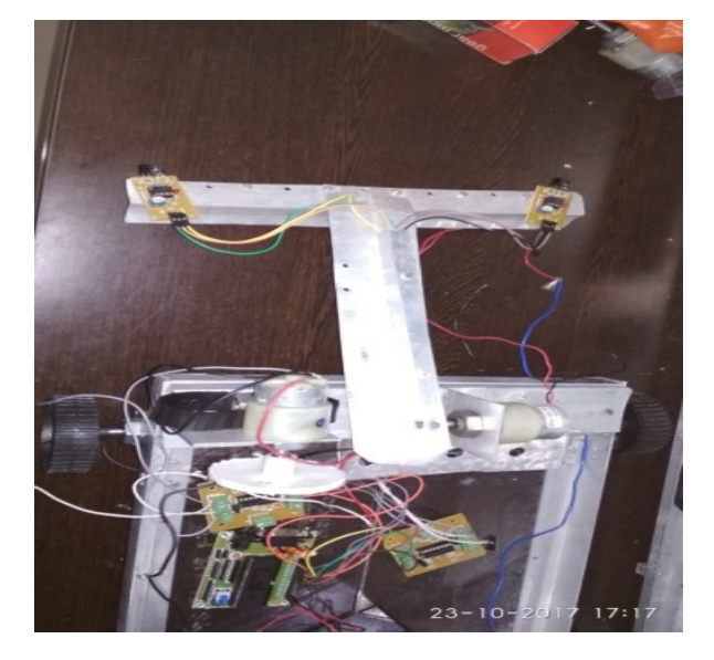
Fig 3: Proto type model

The tilling arm is driven by the DC motorwhich is driven by L293D motor driver[4]. 12v is supplied to the motor driver with battery. When the timer[8] reaches the given value, themotor rotates in opposite direction for asmaller duration[11]. When an obstacle isdetected by IR sensors, the motor turns to itsright-side.