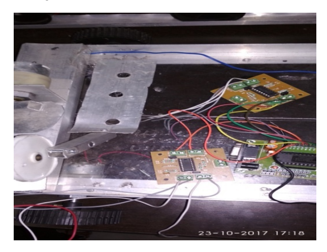
Fig 4: Sowing arm of robot

A storage box is placed where we can store the seeds and it has holes at the bottom. Theholes will be opened with the help of a shaftattached to the motor[12] which moves to and froand allows seeds to fall through the holes[6].