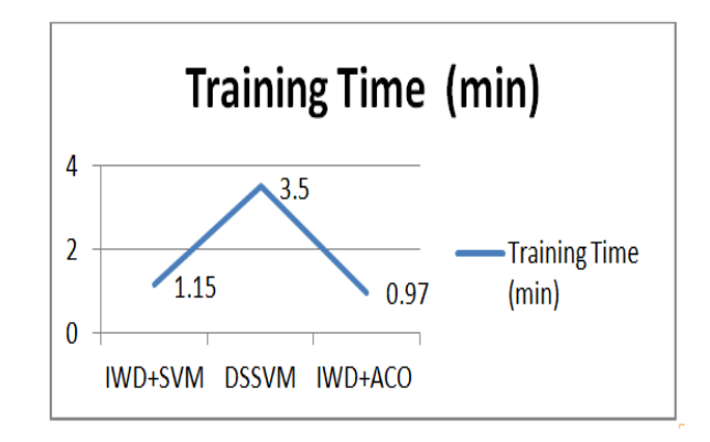
Figure 2. Graphical Comparison of Training time with previous works

The graphical comparison of training times can be as shown in figure 2 which depicts huge differences in training time. As can be seen from the comparison most of the earlier works on feature selection relied on exhaustive search methods like SVM, RST etc.