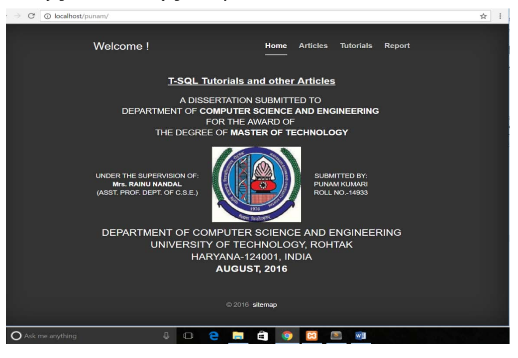
Fig 3. Outlook of Home Page on test server

server will go the "index. Php" file and will convert all code into CSS and HTML code, after that provide to client result as an output of CSS and HTML format. The screenshot gives the result of same index php code.