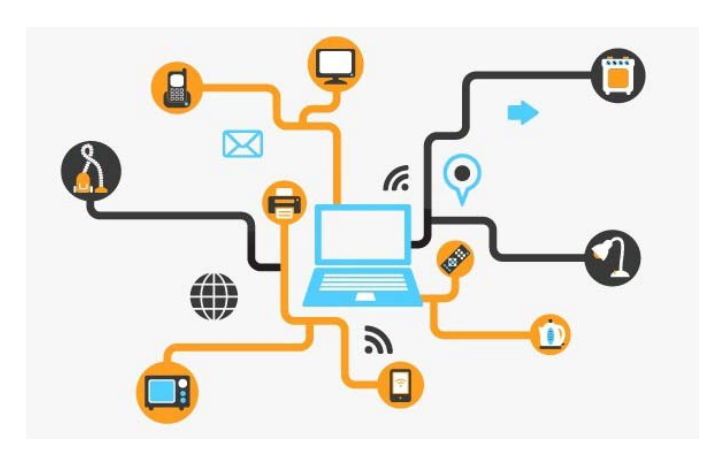
Fig 1. IOT scenario

Things can be anything - a mobile phone , wrist watch a microwave oven, a vault , transportation bus, or even a house too. So it can be any physical object that is connected through a network and devices share information among them .Refer figure 1