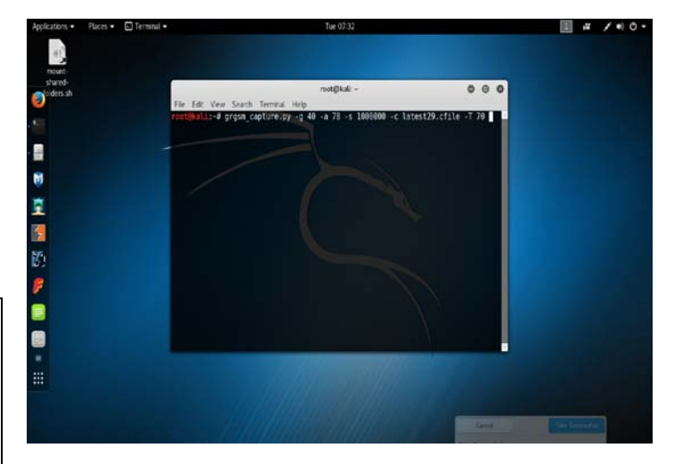
Figure3: Capturing gsm signals using RTL-SDR and saving them into .cfile.