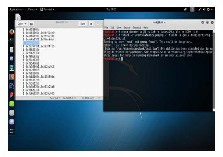
Figure 6: Save the file with .pcap extension and search gsm.a_tmsi parameter using tshark a Wireshark command line interface and use sort, unique count, utilities of bash shell and save results into a text file.