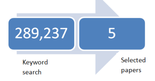
Fig 1.2: Selection of papers from the ACM database

In the ACM digital library, the keyword gave 289,237 results. Refining the search andstudying abstracts gave us 5 relevant papers finally.