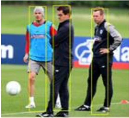
Fig 3.Human detection results