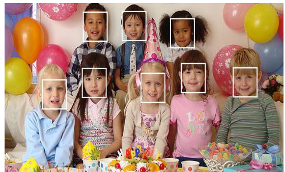
Fig 2 facedetection results by pattern features.

After training the proposed cascaded face detector, evaluated the face detection accuracy using two kinds of face databases: the FDD database and the Face Detection Data Set and Benchmark database shows in fig 2.