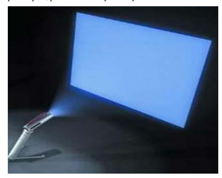
Figure 4. Display Pen projecting A4 Size Screen

In PISM technology, display pen replaces the need of physical monitor. Like in case of keyboard PISM uses virtual keyboard, similarly it uses the concept of virtual monitor. It uses the LED projection for display. Pen provides the projection of A4 size and having resolution 1024 * 768. It displays the pictures with clarity and good clarity. There are various projection technologies like CRT projector that uses cathode ray tubes, LCD projector that uses light gates, LCOS projector that uses liquid crystal silicon, etc. As the screen is displayed virtually it replaces the need of physical monitor. This feature makes the 5 pen pc compact, portable and easy to carry.