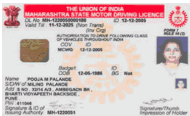
Figure 1: Driving License (Smartcard based)

Smart card is a credit card sized plastic card which is embedded with an electronic chip. Nowadays, the paper based driving licenses have been replaced by smart cards which contains all the details about the owner in a chip embedded within the card. This chip contains memory as well as a processor integrated in it. The processor runs an operating system designed especially for smartcards. The chip can not only store information but also process the data in it. The user data is organised in a well defined file structure. The card data is transacted through a smartcard reader that is attached to a computer. The data inside the chip can be accessed via access control protocols predefined in the operating system. The memory size of the smartcards is typically in the range of 4KB to 150KB. Smartcards are being implemented in many applications today as healthcare, banking, ticketing, shopping etc. The processor of the smartcard could be either an 8-bit or a 32-bit processor. The OS is present in the ROM of the processor. Moreover, they also have cryptographic processors. There is a well defined file structure maintained within it. Thus, a smartcard is just like a mini computer embedded in a chip.