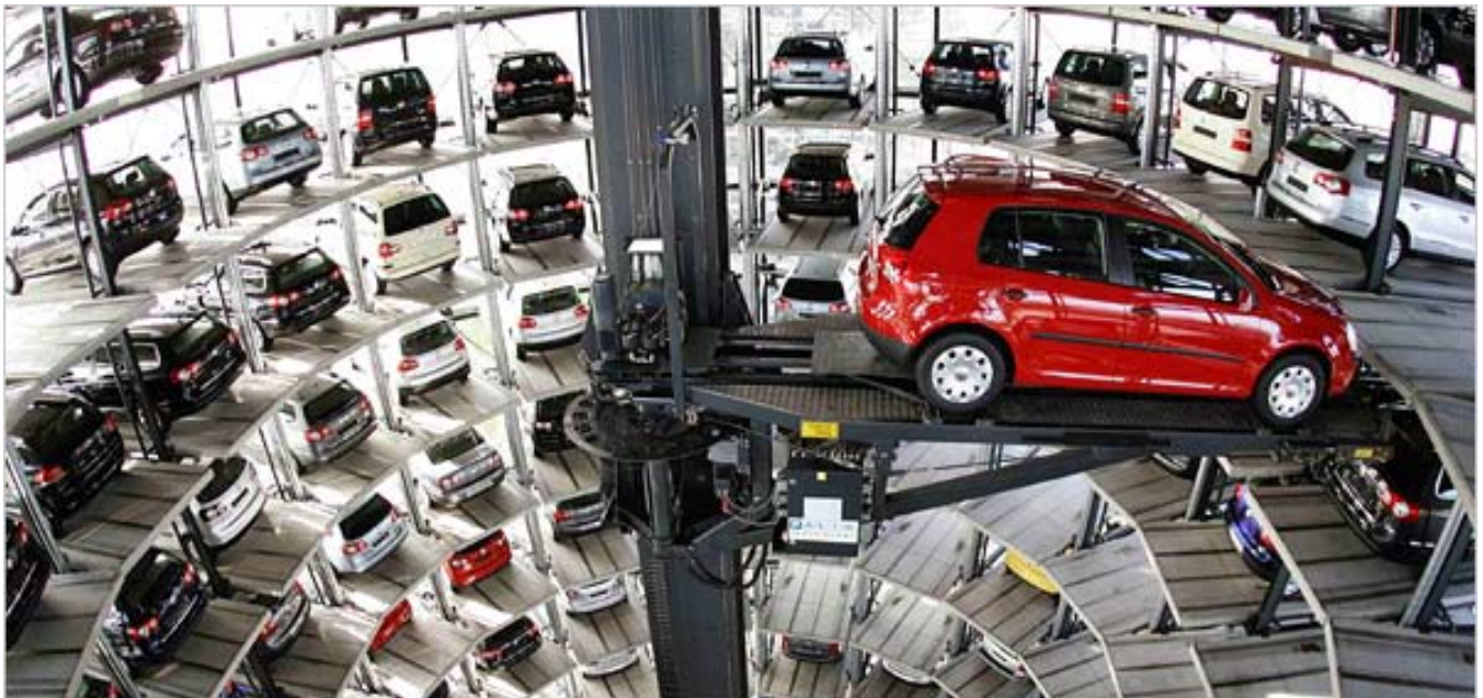
Figure 3: The Proposed Parking System

Thus this fully automated parking system theoretically eliminates the need for parking attendants by using the vehicle owner's driving license as a means of authentication and vehicle identification.