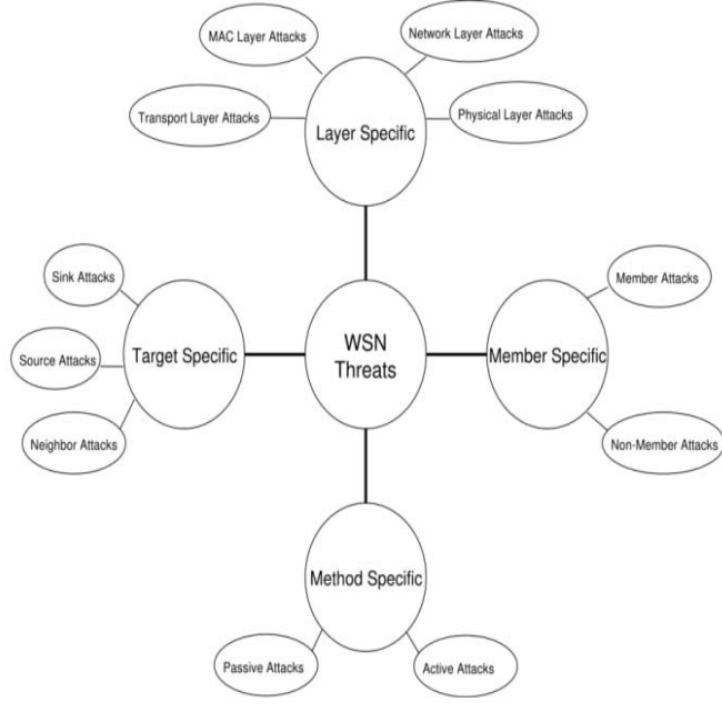
Figure 3.WSN Threats

Based on the characteristics and goals of the attacks and attackers, threat model of WSN can be presented by comparing them on the most important classes. This model of WSNs is presented by attributes such as the damage level caused, location, network functionality and attacker's strength [1]. In this section each of these is explained with respect to the function and effect of the attacks. Figure 3 shows the threat model that has been used in this paper to evaluate various attacks and effects of these attacks on the network.