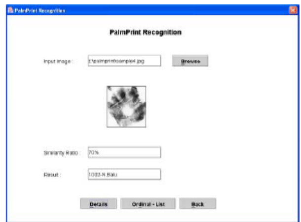
Figure 5. Output Form 4: Palm Print Recognition

The training set is used to adjust the parameters of the Gabor filters only. All the experiments were conducted on the testing set see figure 3, 4, 5, and figure 6. We should emphasize that matching palm prints from the same sessions was not counted in the following experiments. In other words, the palm prints from the first session were only matched with the palm prints from the second session. A matching is counted as a genuine matching if two palm print images are from the same palm; otherwise it is counted as an imposter matching. Number of genuine and imposter matching are 47,276 and 22,987,462 respectively.