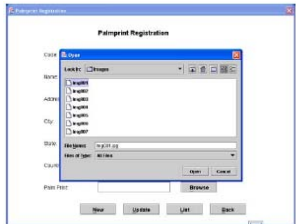
Figure 4. Output Form 2: Palm print Registration