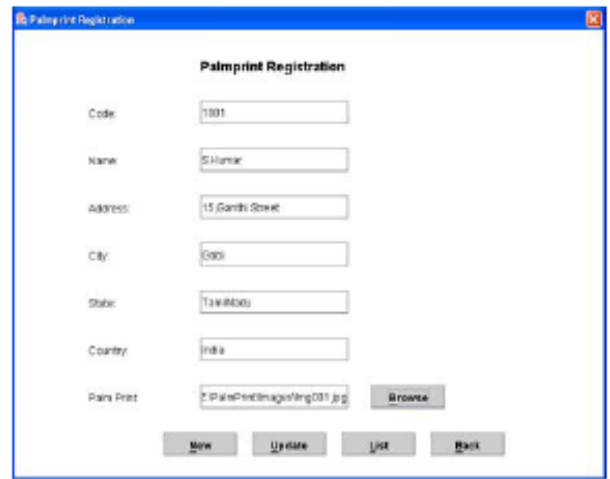
Figure 3. Output Form 1: Palm Print Registration

Palm print images from 284 individuals using the palm print capture device as described in are collected. In this dataset, 186 people are male, and the age distribution of the subjects is: about 89% are younger than 30, about 10% are aged between 30 and 50, and about 1% is older than 50. The palm print images were collected on two separate occasions, at an interval of around two months. On each occasion, the subject was asked to provide about 10 images each of the left palm and the right palm. Therefore, each person provided around 40 images, resulting in a total number of 11,074 images from 568 different palms in our database. The average time interval between the first and second occasions was 73 days. The maximum and the minimum time intervals were 340 days and 1 day, respectively. The size of all the test images used in the following experiments was 384x284 with a resolution of 75dpi. The database is divided into two datasets, training and testing. Testing set contained 9,599 palm print images from 488 different palms and training set contained the rest of them.