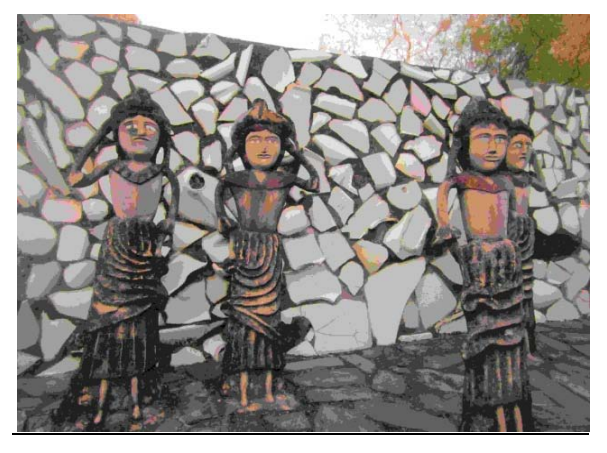
Figure 4 : Image at Q-Factor 1