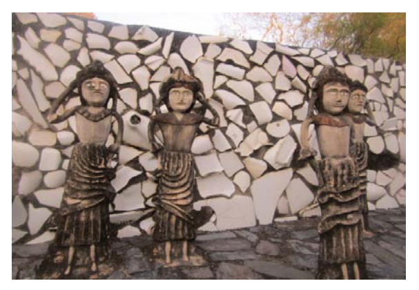
Figure 3 : Original Image

For image shown in figure 3, the following results are obtained, shown below in figure 4, figure 5, figure 6 for various values of Quality factor=1, 30, 90 respectively.