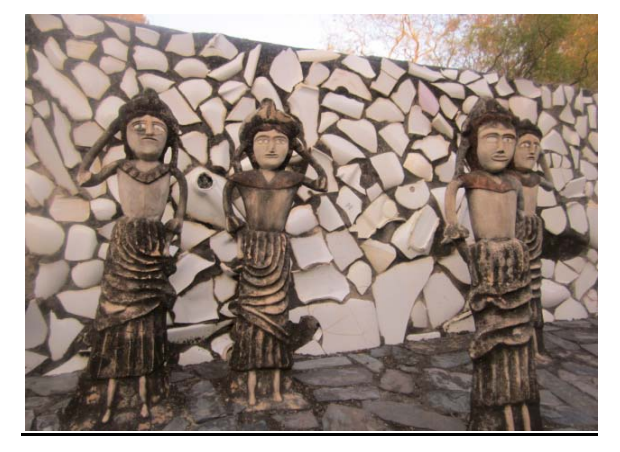
Figure 6 : Image at Q-Factor 90

The graph shown in figure 7 shows variation of size of original image (figure 3) against Q- factor.