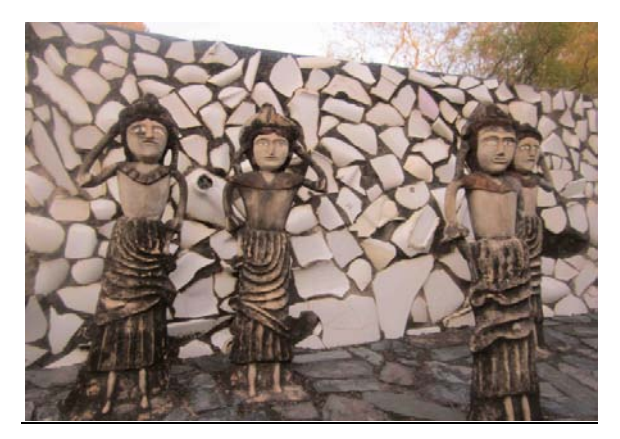
Figure 5 : Image at Q-Factor 30