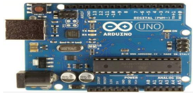
Fig 4: Arduino uno micro-controller