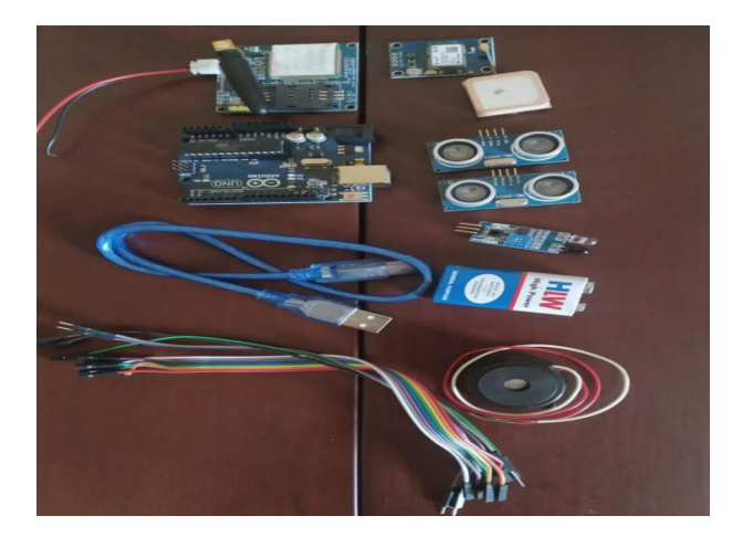
Fig 1: Images of components used in the proposed prototype.

2nd International Conference on Advances in Computing & Information Technology (IACIT-2020) Date: 29-30 April 2020 Organized by School of Computing and Information Technology Reva University, Bengaluru, India