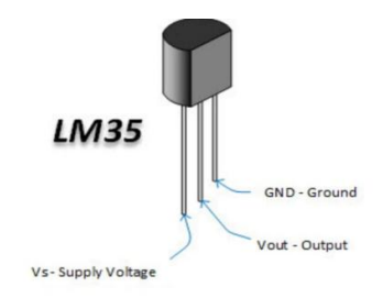
Fig 6: LM35 thermistor with pin configuration

It is one kind of commonly used temperature sensor that can be used to measure temperature with an electrical output comparative to the temperature in degree celsius.