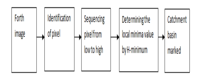
Figure 2. Traditional watershed transform

Thus the above method of morphological transformation holds good for not only greater image but also for the small-scale areas of the bubble in the froth images on applying the segmenting process.