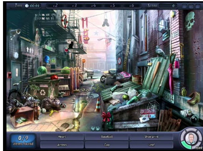
Fig. 4.0 Criminal Case (Level 13 Gameplay)

It provides questions related to only chemistry equations i.e. only one subject. Hence, it gets boring after a while. The interface is difficult to understand for new players; hence it gets tedious at the start. In the end, for more difficult chemistry equation like for breaking a molecular bond, player has to break the tiles which is very difficult and hence after a certain period, one tends to stop playing this games. It can be a frustrating game as per reviewers [11].