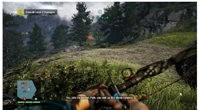
Fig. 3.1 Far Cry 4