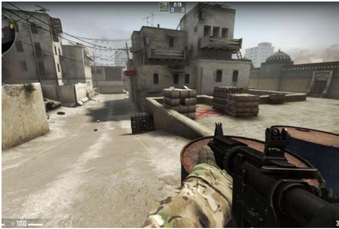
Fig. 1.1 Counter Strike- Global Offensive (Game Scene)