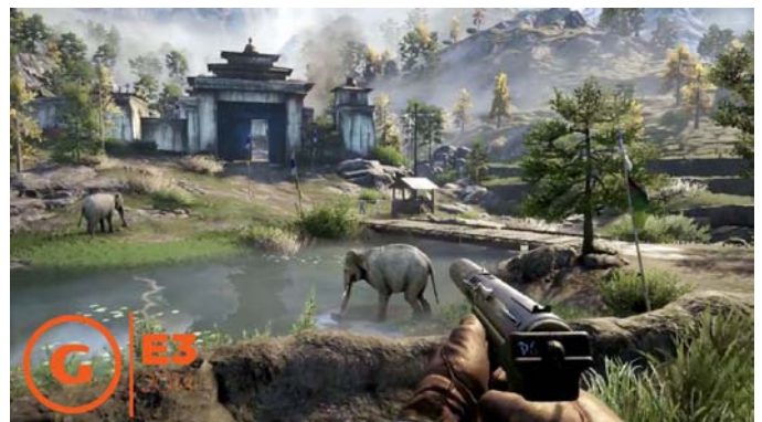
Fig 3.2 Far Cry 4 (Killing an animal)