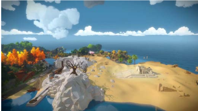
Fig. 7.0 The Witness

The levels are limited and basic. For e.g. sand level, water level, mountain level etc. The game tells the story again and again which makes it more boring and tedious according to the reviews [13].