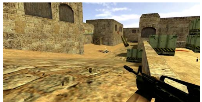
Fig. 1.0 Counter Strike (Game Scene)

It develops addiction from the young age causing a severe effect on the lifestyle.