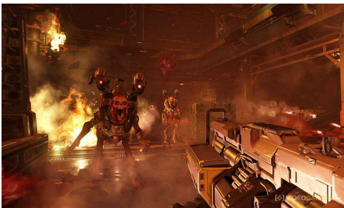
Fig. 2.0. Doom (Game Scene)

It supports some mythological controversies of concepts like hell, demons or angels which can make an impact on a child’s thinking. It doesn’t help in a good kind of way and can affect mental health of children as it contains much violence and few disturbing components like devils as shown in the figure 2.0 below.