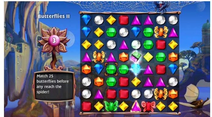
Fig. 4.1 Bejeweled 3 (advanced level)