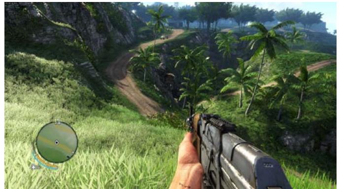
Fig. 3.0 Far Cry 3

The wildlife can be unnecessarily aggressive which can result in a strong negative impact. In order to survive, player has to kill different animals which can result in a bad influence. The recent releases have a similar structure for the map, as shown in the example below. In the recent reviews, people have considered this game as a dumb game because of the stories [7].