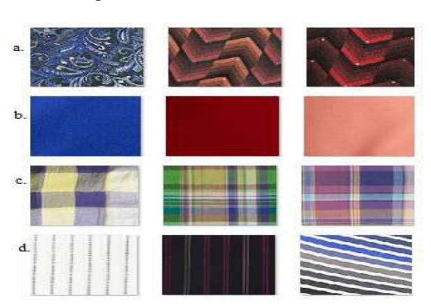
Fig 1: Dataset of training image

The entire clothing pattern can be inside this vast datasets of CCYN. Each one pattern has its own directionality, intensity and lighting variation. If the test image of stripe pattern the image patches are horizontal direction and but in the training set the image patches are in vertical direction. This can be matched by rotation, illumination changes. This adjustment can be done only by extracting the global features like energy, entropy, variance, uniformity. Once the superlative function has been estimated according to the particular image, every pixel in the image is mapped in the same way, independent of the value of surrounding pixels in the image. These techniques are simple and fast, but they can cause a loss of contrast. Examples of common global tone mapping methods are contrast reduction. Local features are the points, small patches and lines. This two features combined together to get the position of each image pixels. These pixels can be in the matrix form. So they combined together using the classifier[1].