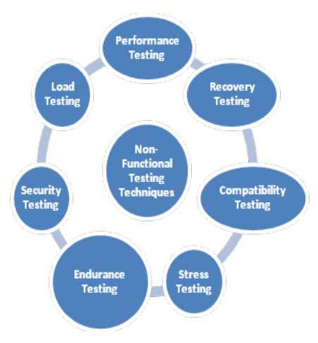
Fig 3. Few Examples of Non-Functional Testing Techniques

Non-Functional testing is performed at all test levels. It is basically concerned with the non-functional requirements and is modeled specifically to assess the readiness of a system according to the various criteria which are not covered by functional testing[9]