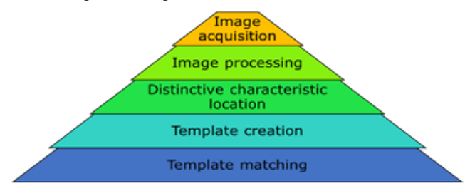
Fig 2: Phases of face recognition implementation