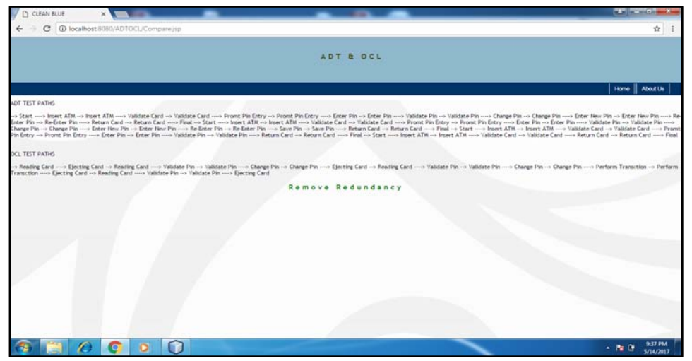
Figure 2: Individual Approach

using individual approach where path is calculated using Activity diagram and FSM separately (Figure 2: Individual Approach); in combined approach (Figure 3: Combined Approach) results are combined then redundancy is removed before generating the test case. The generated test cases are again checked for duplication. Final outcome of the MBT using combined approach is to generate test cases with more test cases as we can see that number is 83 and removal of unnecessary, redundant test cases.