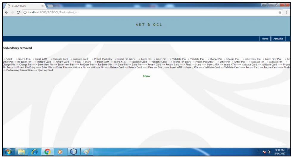
Figure 3: Combined Approach