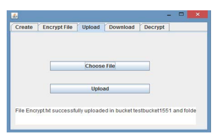
Figure 6. Uploading Encrypted File (Encrypt.txt) in folder 'test' inside bucket 'testbucket1551'

File Edit Format View Help [41'15 #41 A Pr0-0-1