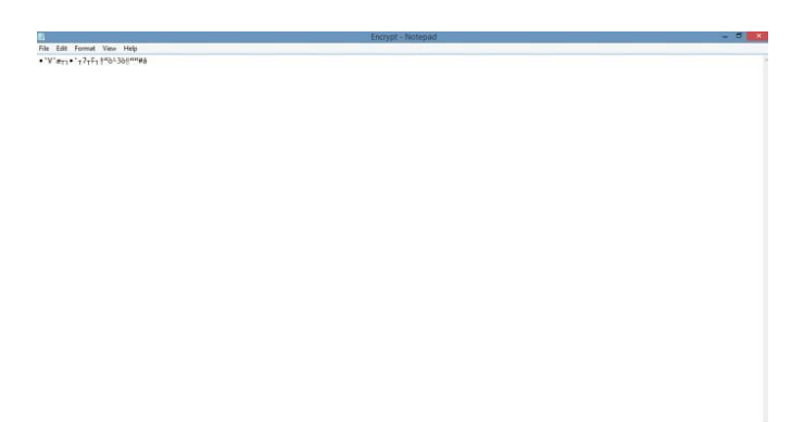
Figure 5. Content of the Encrypted File (Encrypt.txt) present at C:\Users\MY PC\Encrypt.txt

Figure 4. File (File.txt) encrypted as Encrypt.txt and present at C:\Users\MY PC\Encrypt.txt, also a Key (Key.txt) is generated during encryption at the same location