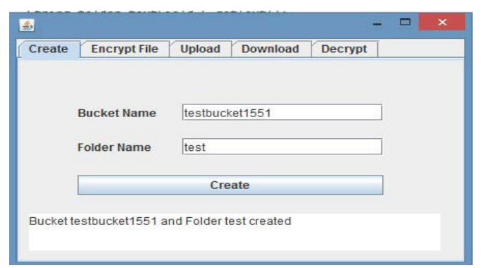
Figure 1. Bucket 'testbucket1551' and Folder 'test' creation in Amazon S3