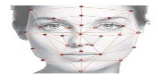
Figure 3: Structure of Face

Face recognition means measurement of facial features. It is computer system application for automatically verifying or determining an individual from a digital image or a video framework from a video source. One of the techniques to do this is simply by evaluating selected facial features from the image as well as from facial database.[1]Through a digital video camera this technique records face images and examine various characteristics. Face recognition effected by camera brightness, light, angle etc.There are two types of technologies used in Facial recognition.